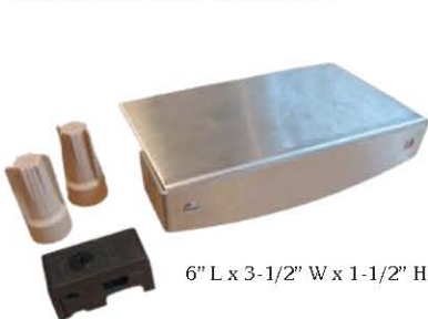
6" L x 3-1/2" W x 1-1/2" H

The commercial grade stainless steel fixture installs easily under wall cap or step material. A 72 inch Wire Harness and choice of cable connector are included.