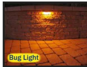
Yellow light from specially coated lamp does not attract flying or swarming insects.

Power Tap Connector™ (For use with 12/2 or 10/3 Circuit Cable only)